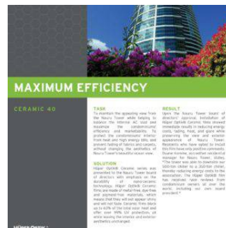
Maximum Efficiency (pkg of 25) $6.50 (TES-MAE-F)