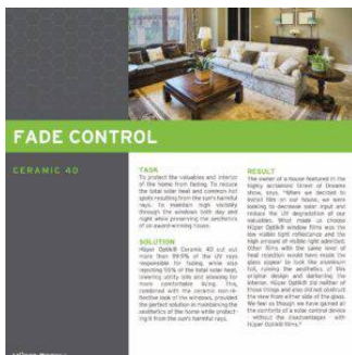
Fade Control (pkg of 25) $6.50 (TES-FAC-F)