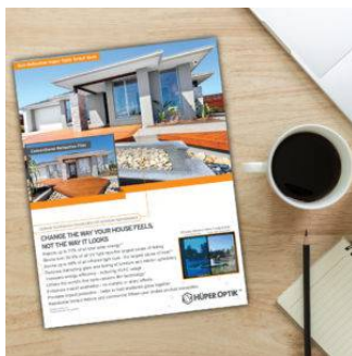
Change the Way Flyer - (25 per Pkg) Non-Reflective Huper Optik Select Sech film featured $7.75 (FLY-CTW-F)