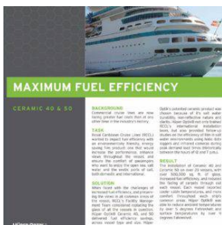
Royal Caribbean Cruise Line Testimonial Cards (pkg of 25) $6.50 (TES-RCCL)